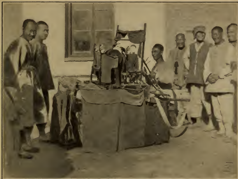
CHINESE PUNCH AND JUDY.